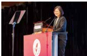
Speaking at the opening ceremony, President Tsai thanked GOH and noted that Taiwan has made great strides in gender equality through the combined efforts of activists in the women's movement and the government.

Speaking at the opening ceremony, President Tsai expressed her gratitude to GOH and noted that through the combined efforts of activists in the women's